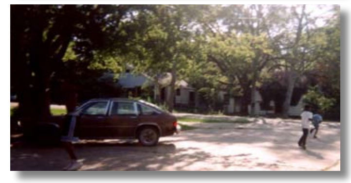
Chakeeta's play area pictures are exclusively of the parking lot in front of her apartment building. In fact, her