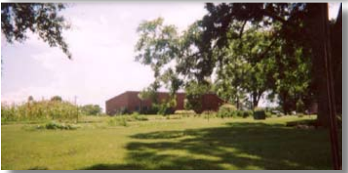
Chanise took pictures of her front yard and the open lot across the street where she and her sisters sometimes play.